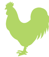
MEDIUM 6 lb.*