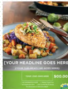
Customizable Table Tent

Customize with your own image, headline, logos & price